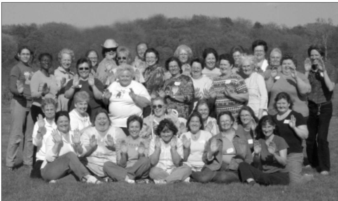
Laughing, wind-blown and a little sunburned, retreat attendees beam Reiki.