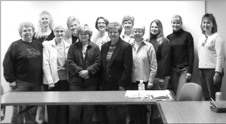
Staff and volunteers in the hospice Reiki program.

peace. Continued Reiki treatments seem to bring a sense of calm to the patient and their family, and may also have a positive effect on decreasing the incidences of pain, shortness of breath, and anxiety. It all