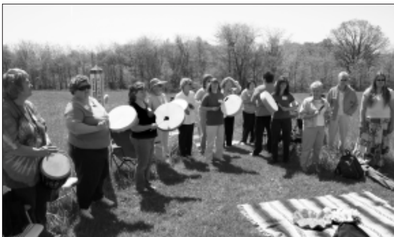
We gathered to honor Mother Earth in prayer and song, and to infuse with Reiki our offerings of bird seed.

through all the universe...to be with us to teach us and show us the way." Many drummed and chanted "Mother I feel you under my feet / Mother I hear